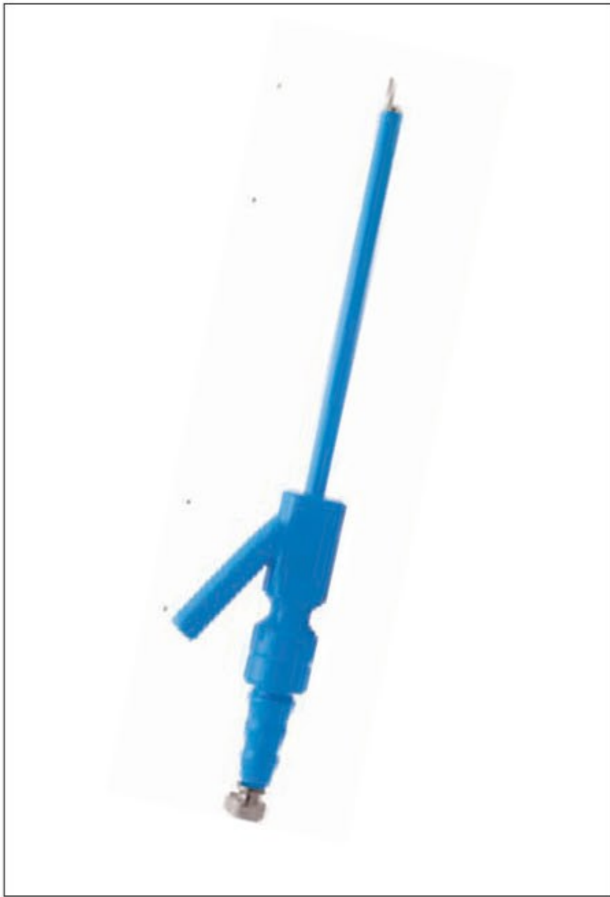
Frazier Suction Tube