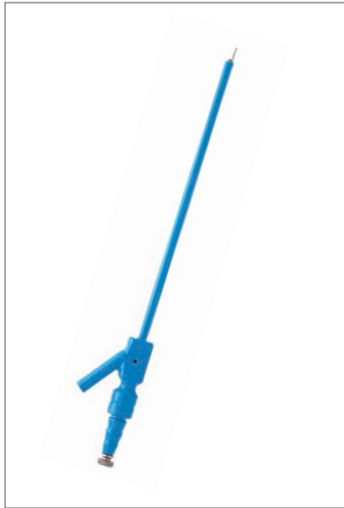
Frazier Suction Tube