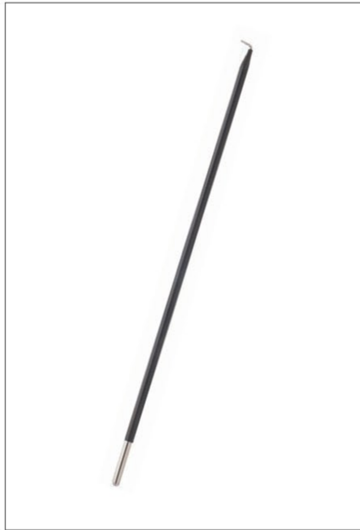
Arthroscopic Electrodes Hockey