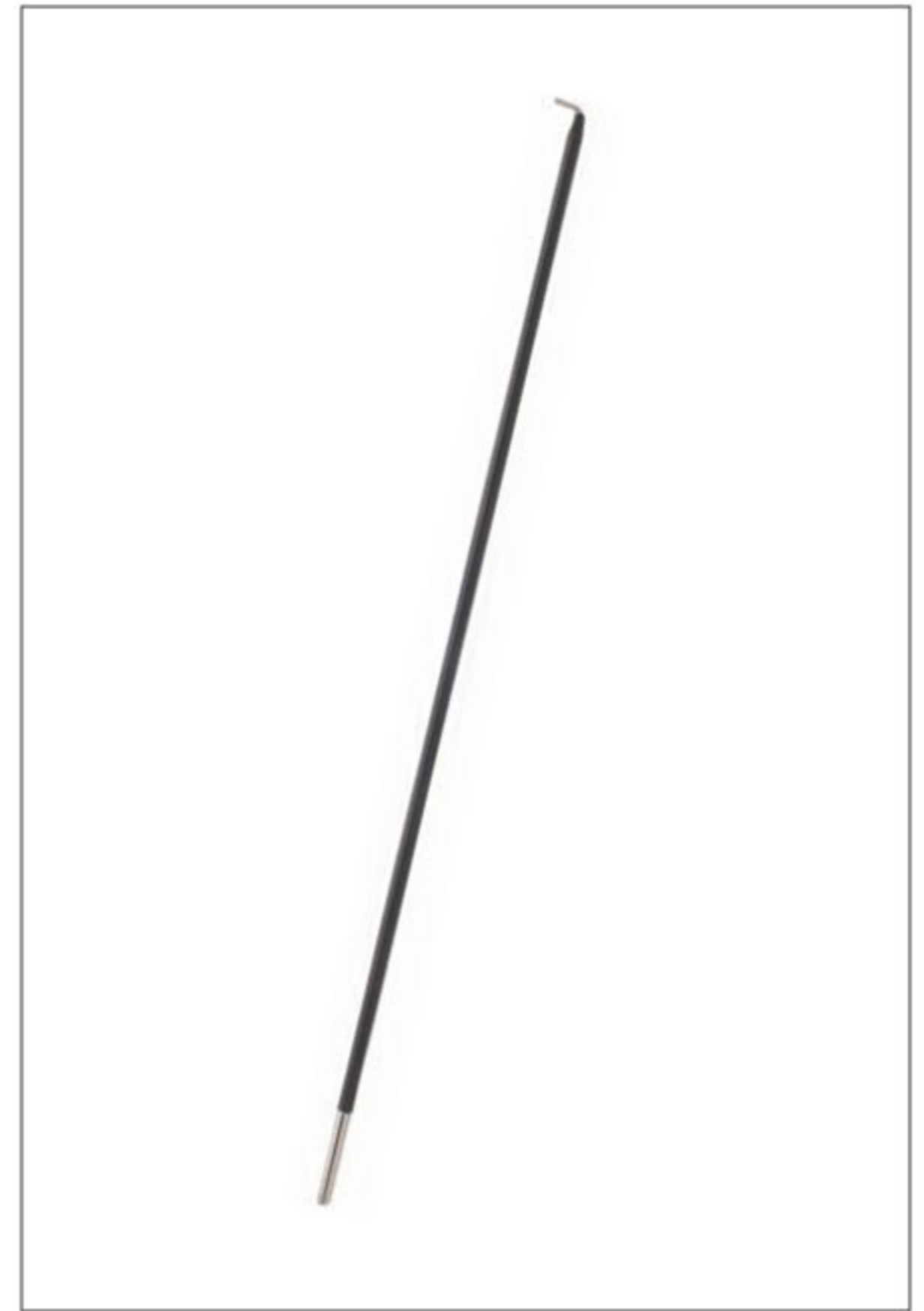
Arthroscopic Electrodes Hockey