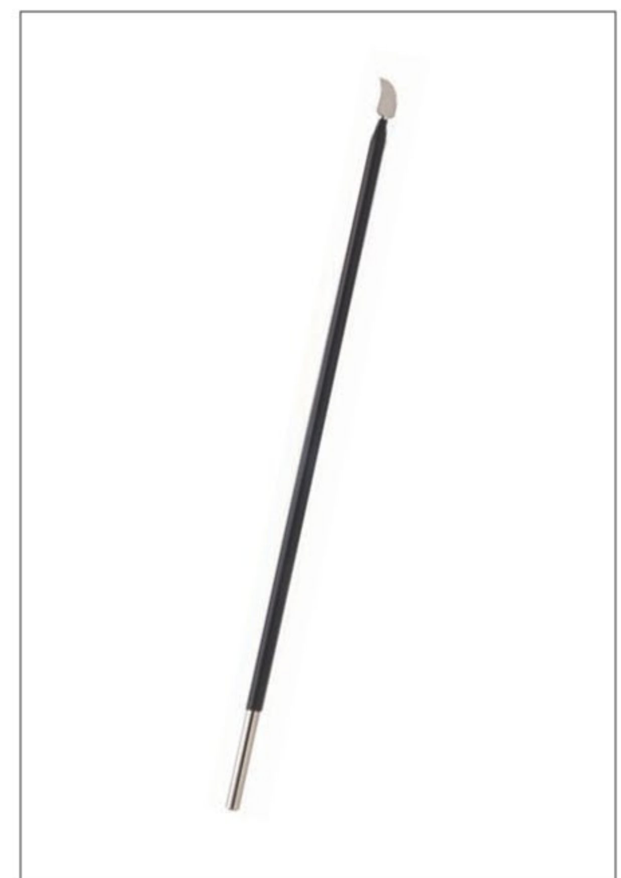
Arthroscopic Electrodes Hook