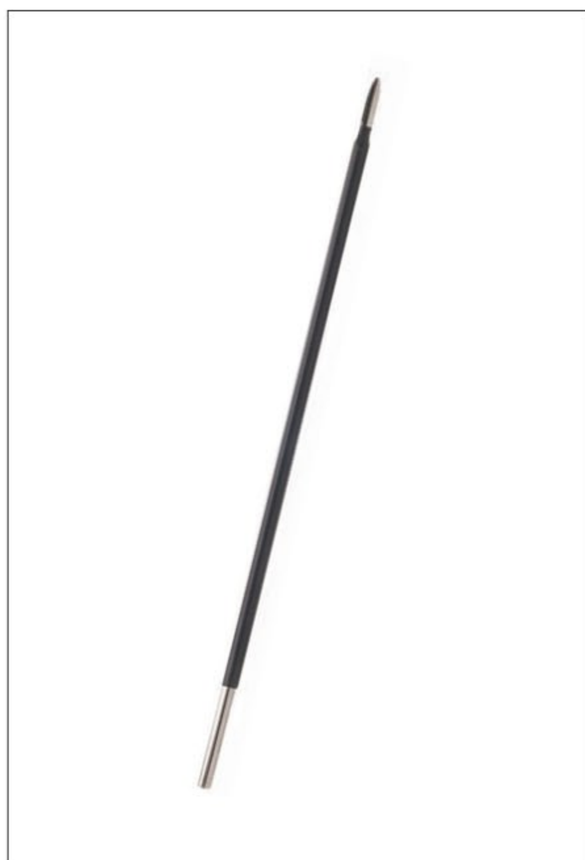
Dagger Arthroscopic Electrodes